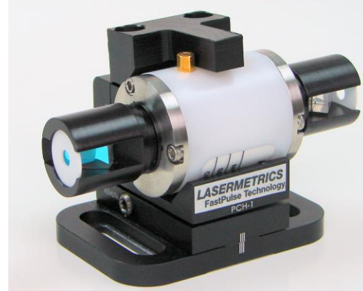
PP45 Polarizers attached to a Q1059P Pockels cell Mounted on a precision Pitch/Yaw Gimbal

Plate polarizers with coatings provide very high extinction from a single plate configuration. PP45 Series standard polarizers incorporate a 45° angled, coated optic mounted in a ported cell. Precision mounting methods insure stress-free high performance. The housing design incorporates an offset input ceramic aperture, the internal beam path and mechanical center lines are coaxial.